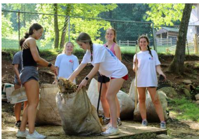
Pictured above are members of a youth group from a Church in Georgia visiting in June

For the past 22 years, Animal Haven has relied on our volunteers and community to keep it the quaint sanctuary that it is. We are small in the sense we are on ten acres compared to sanctuaries like well-known Best Friends, Black Beauty Ranch, Farm Sanctuary in New York and California to name a few. We are currently caring for 84 rescued animals at the farm.