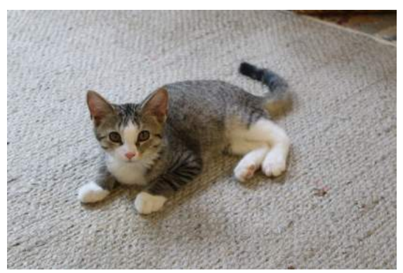
Wild Willy successfully transitioned from the Thrift Shop to a loving home like the five kittens last year pictured on left.