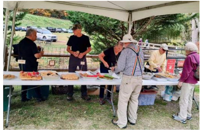
Another major success for the animals. Don't miss it next year!