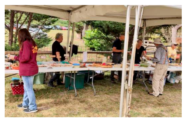
Deciding what homemade vegan food to try first at our annual Fall fundraiser