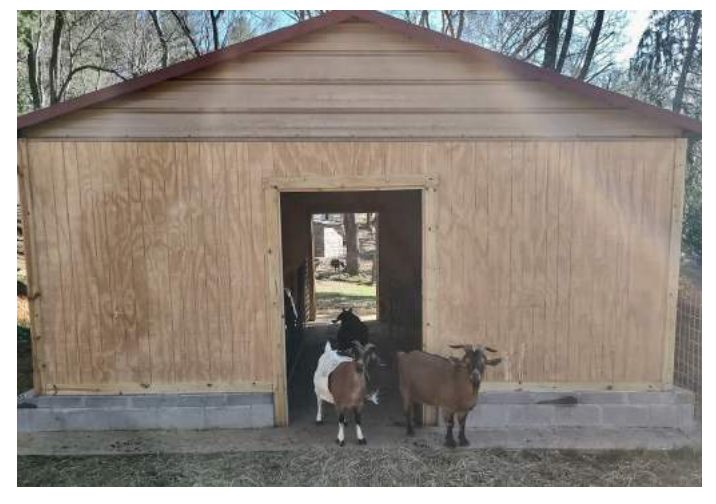
Moonpie, Petunia, and Igor inspecting the new shelter