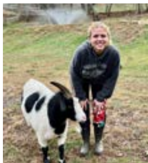
Vick 2 years