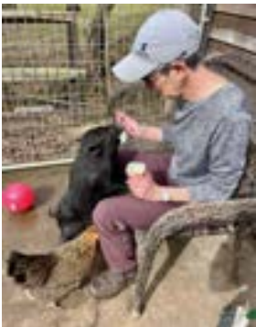
Virginia 6 months