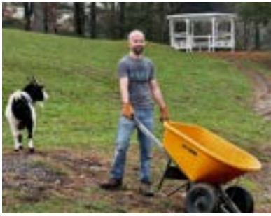
Hunter 3 months